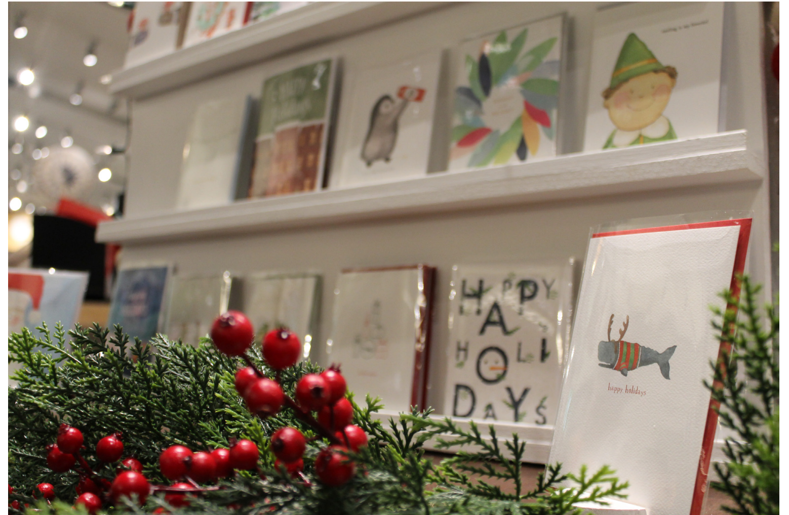
Image text here about this photo text here about this photo text here about this.