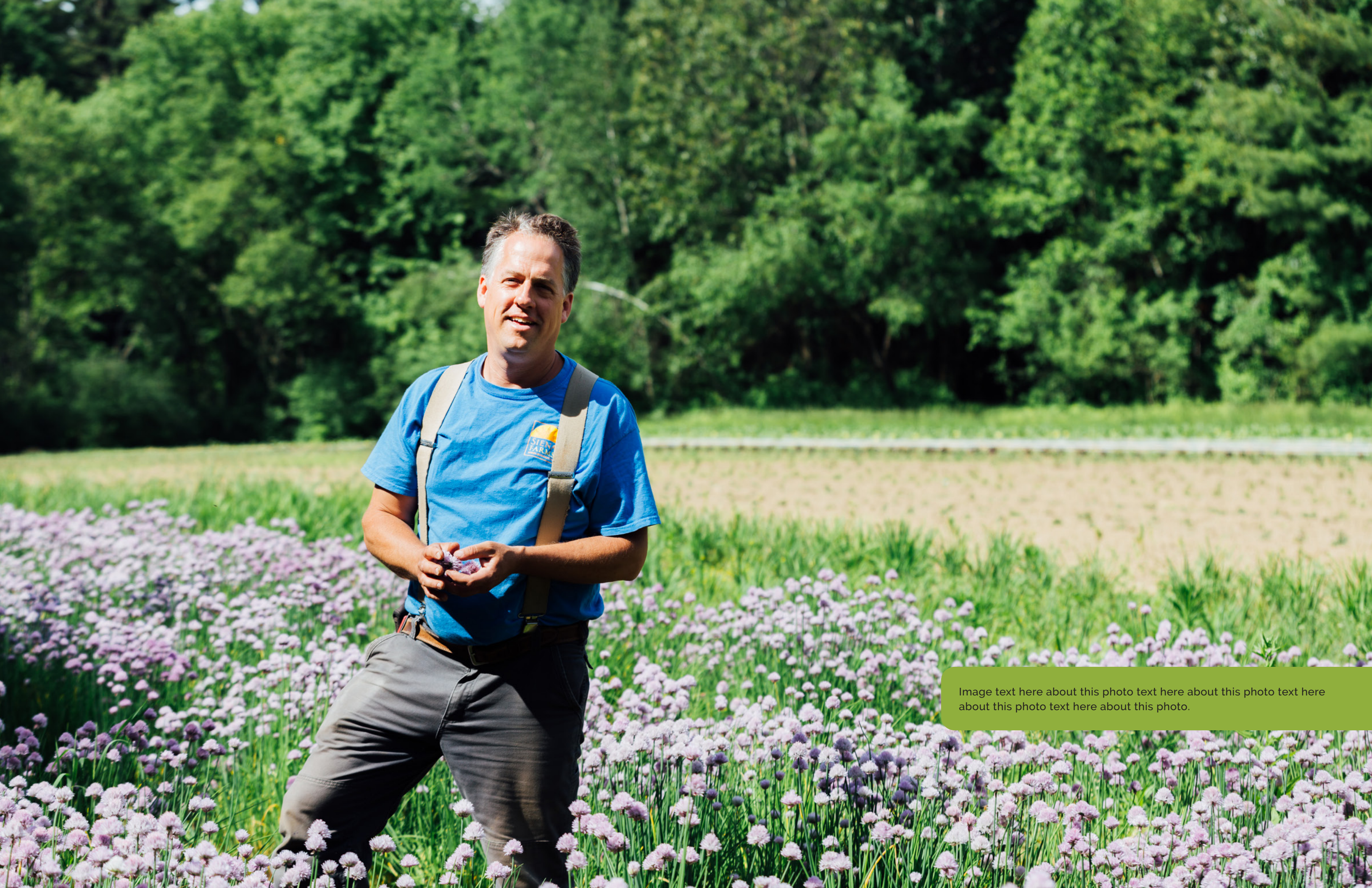
Image text here about this photo text here about this photo text here about this photo text here about this photo.