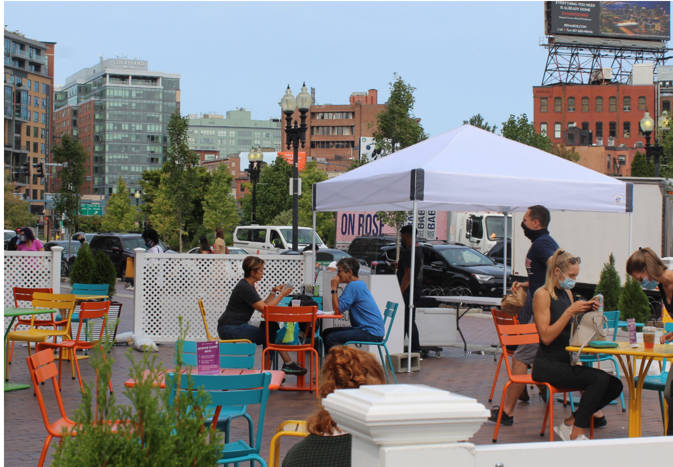
Image text here about this photo text here about this photo text here about this.