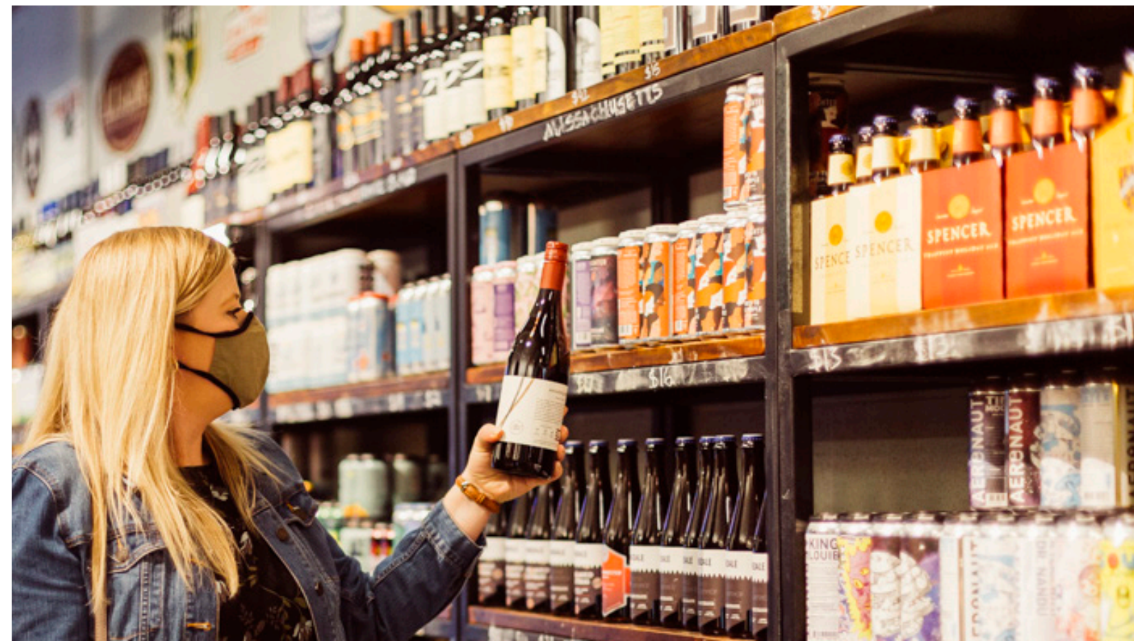
Image text here about this photo text here about this photo text here about this.

While we had been offering our customers grocery delivery long before the pandemic, we saw a dramatic increase in online purchases due to stay-at-home orders. To better serve our customers, in June 2020 we partnered with New England-based grocery delivery vendor WhatsGood for daily delivery.