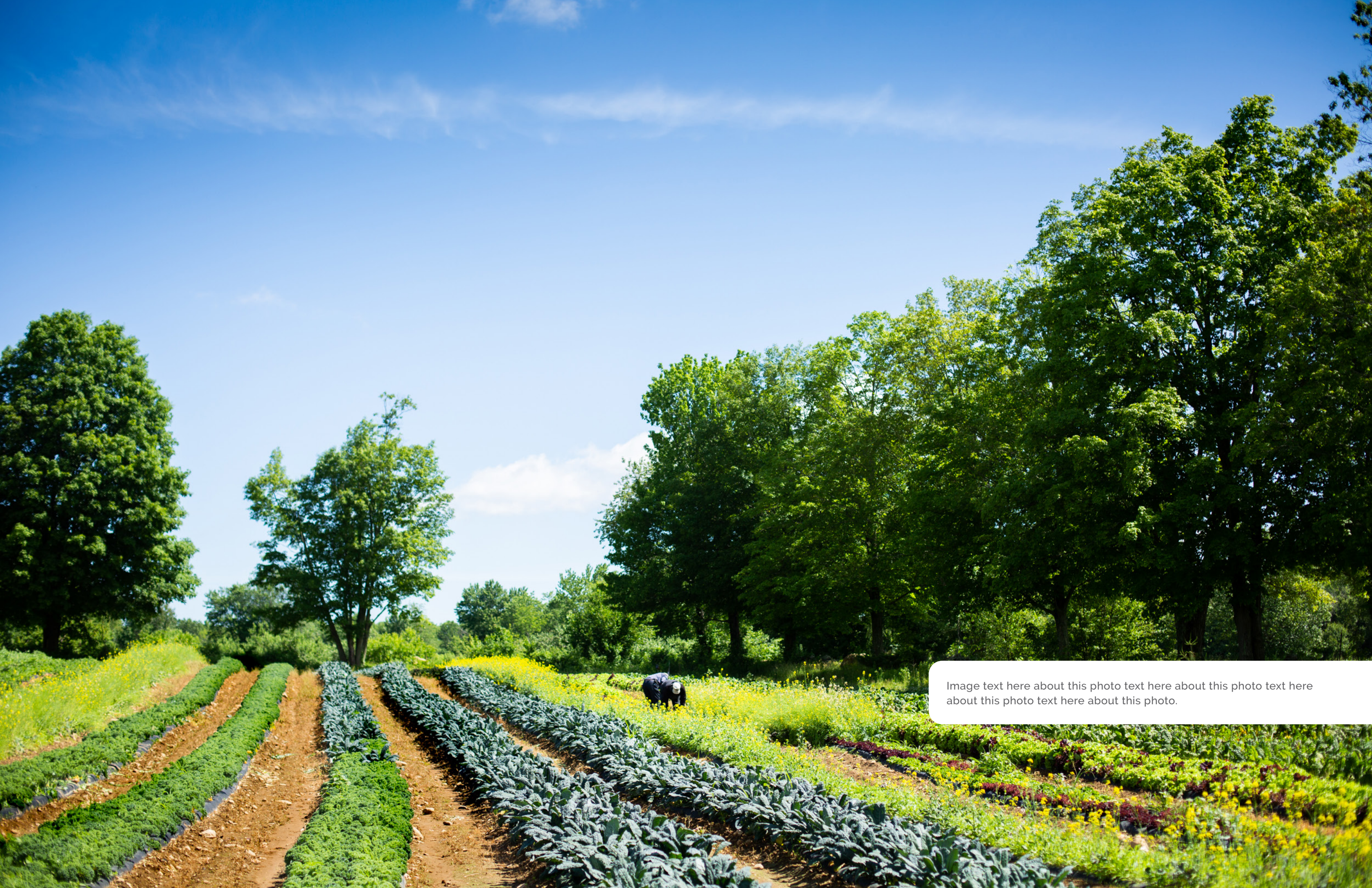
Image text here about this photo text here about this photo text here about this photo text here about this photo.