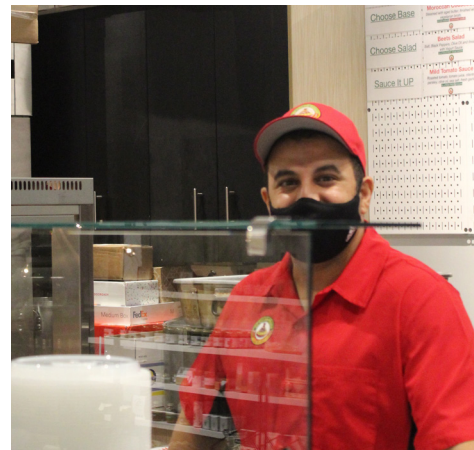
Image text here about this photo text here about this photo text here about this.