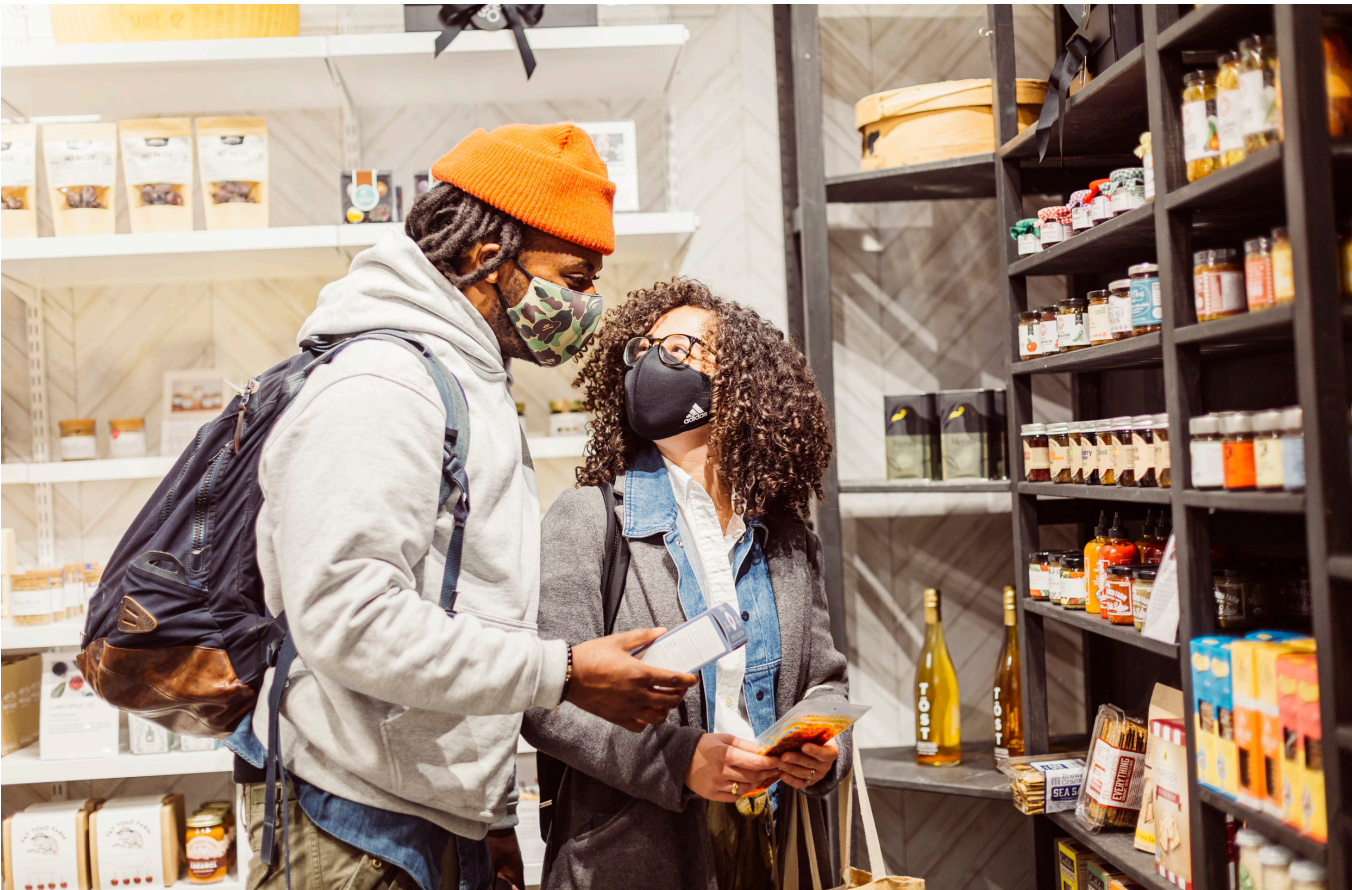
Image text here about this photo text here about this photo text here about this.