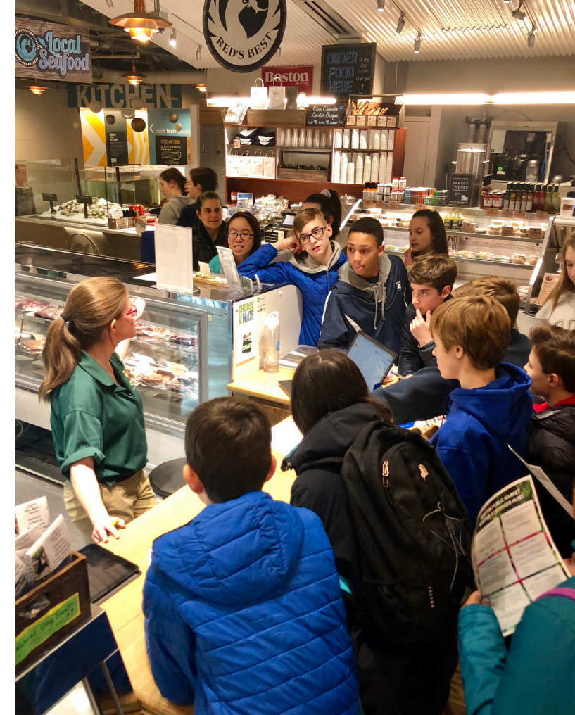
Image text here about this photo text here about this photo text here about this.