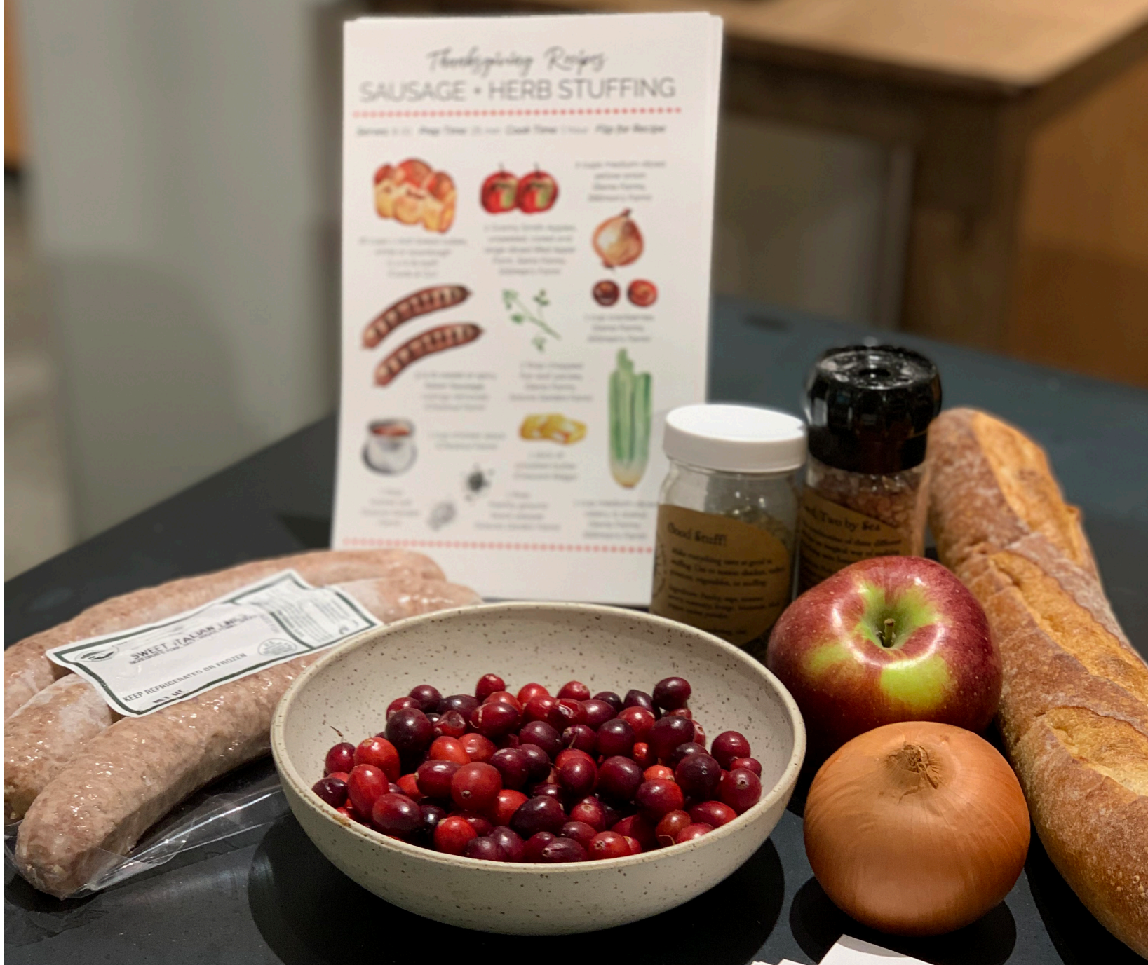
Image text here about this photo text here about this photo text here about this.

Our 2019 Harvest Party, our major yearly fundraising event, was another great success as it continued to celebrate our unique community and showcase our small businesses and agricultural producers. Funds raised through our Harvest Party are dedicated to the Boston Public Market Community Engagement Fund, which provides free public festivals, free field trips and enriching experiences for children, and allows us to continue our work of building a space for community around food.