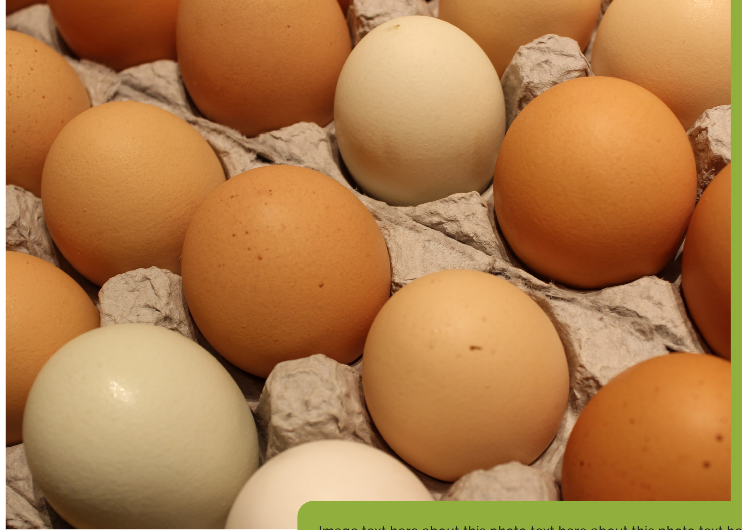
Image text here about this photo text here about this photo text here about this photo text here about this photo.