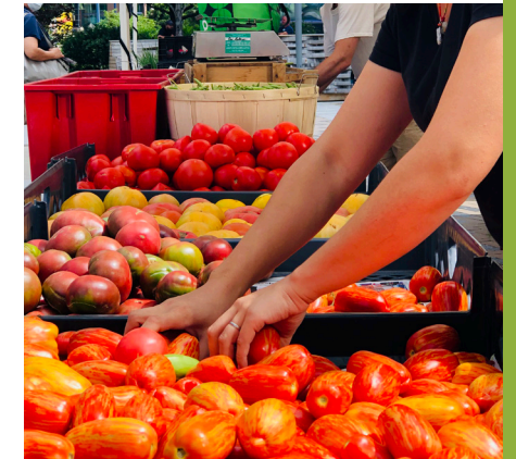
Image text here about this photo text here about this photo text here about this.

During the 2020 season, both the Dewey Square and Seaport markets returned for the season amid new public health regulations in response to the ongoing pandemic. Our outdoor markets stayed bountiful, featuring everything from produce to fresh seafood and BBQ prepared onsite. The pandemic certainly brought on a sharp decline in both commuter and tourist foot traffic, but our vendors remained committed to increasing access to fresh delicious food and providing a safe outdoor activity for our customers.